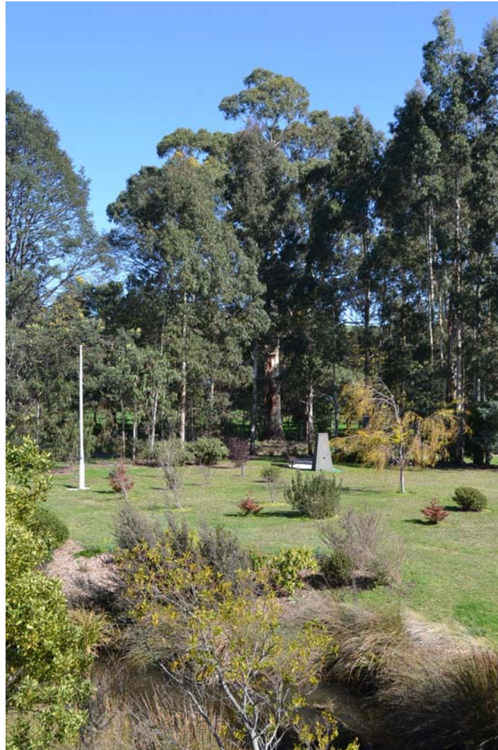
Heritage Park Geeveston